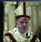
Thomas Cardinal Collins Archbishop of Toronto

CHARISMATIC CONFERENCE JUNE 19, 20 & 21, 2015